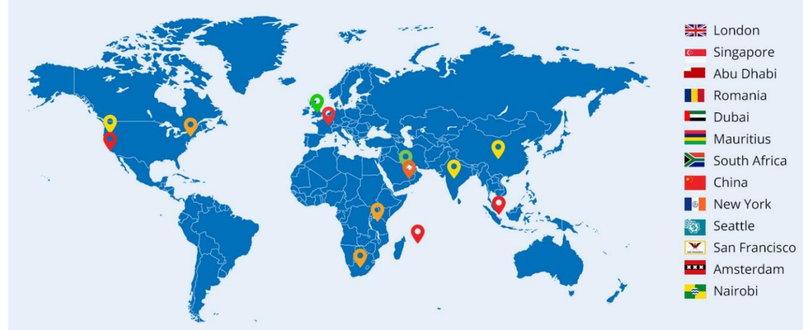
Amity's Global Footprint

At Amity we benchmark only against the best institutions around the world. Our faculty and senior team travel all over the globe to learn and imbibe the best practices so that we can give a solid foundation for learning.